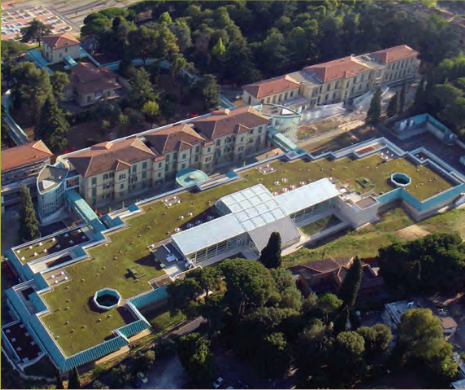
○ Meyer Children's Hospital – Florence, Italy

Many hospitals are using green principles in design and construction