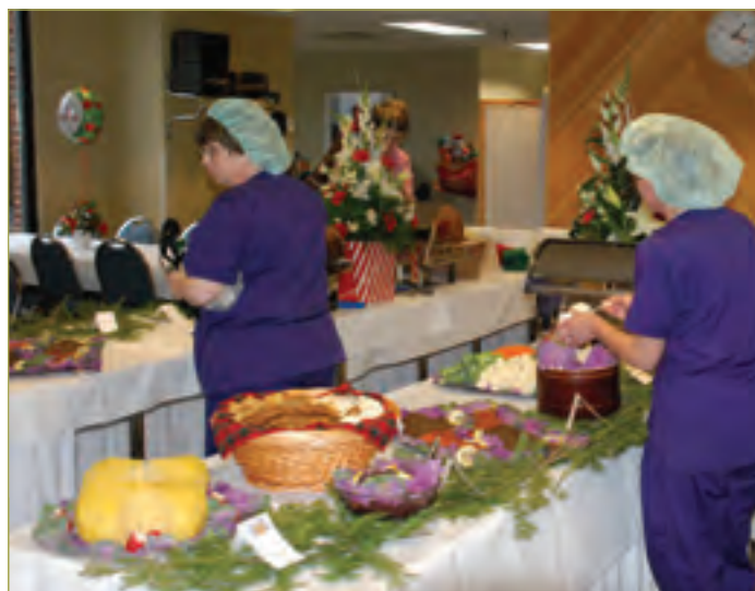
○ St. Luke's Local sustainable food service

USA: St Luke's Hospital, Duluth, Minnesota. This comprehensive care hospital admits over 12 000 patients a year, and treats close to 400 000 more in its many clinics. 78 Over the last decade, St. Luke's has taken steps to make the food it serves to patients, staff and visitors increasingly fresh and sustainable while launching a programme to divert food waste and provide for the local community. Food service staff purchase produce from the local farmers' market and buy products from local vendors, thus reducing emissions from transportation. Since 2003, the hospital has partnered with the group Second Harvest to donate excess food from the hospital kitchen to local families, instead of simply throwing it away. Every day, extra food is labeled and frozen for distribution to local food banks and soup kitchens, providing about 1000 meals a year. The hospital composts almost 40 000 pounds of food waste every year, thus removing it from the waste stream and reducing emissions. This year the facility will introduce an onsite garden as a means to introduce fresh food in the food service operations. 79