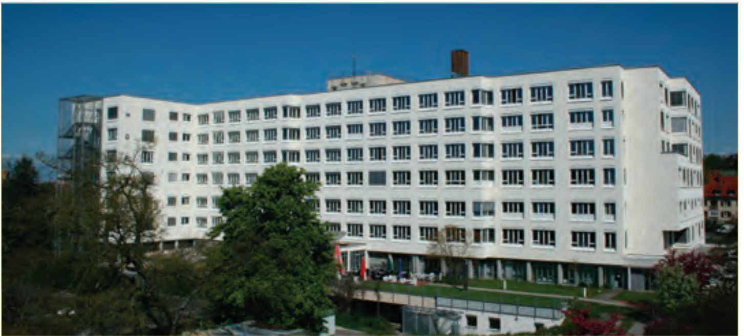
Constance Hospital – Baden-Wurttemberg, Germany