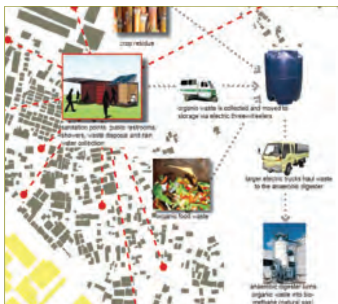
○ Plans for the Embassy Medical Center – Colombo, Sri Lanka